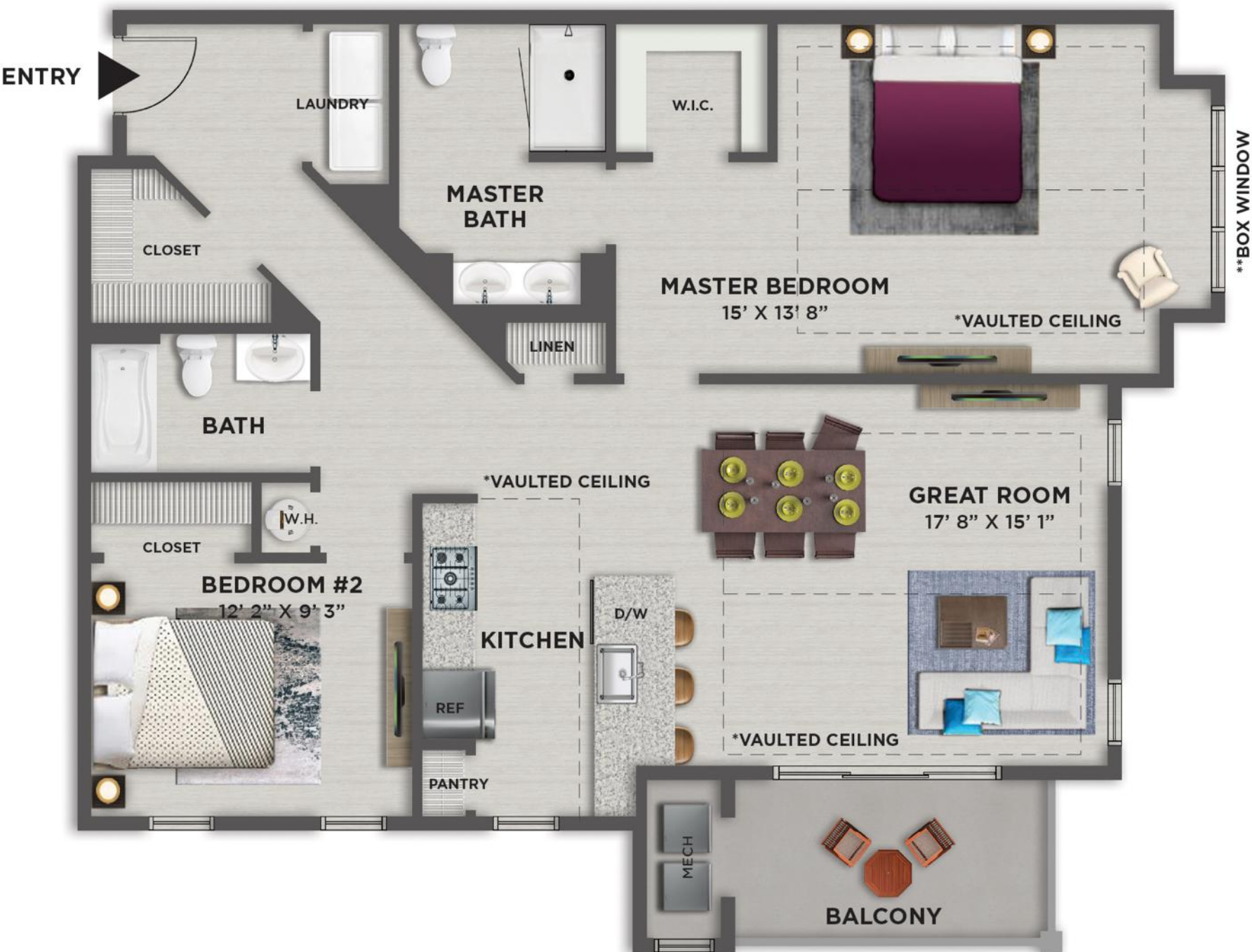
TWO BEDROOM - 2 BATH 1,253 SQ. FT.

*Vaulted/Tray Ceiling on Top Floors Only **In Select Units